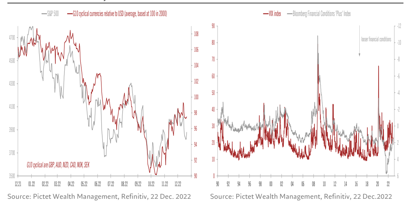
Chart 2: US financial conditions vs. VIX