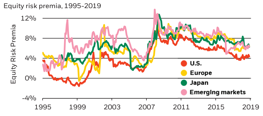
Chart of the week

Past performance is not a reliable indicator of current or future results. It is not possible to invest directly in an index. Sources: BlackRock Investment Institute, with data from Refinitiv Datastream, December 2019. Notes: Data is as of Sept. 31, 2019. We calculate the equity risk premium based on our expectations for nominal interest rates and the earnings yields for respective equity markets. We use MSCI indexes as the proxy for the markets shown. We use BlackRock expectations for interest rates so the estimate is not influenced by the term premium in long term bond yields.